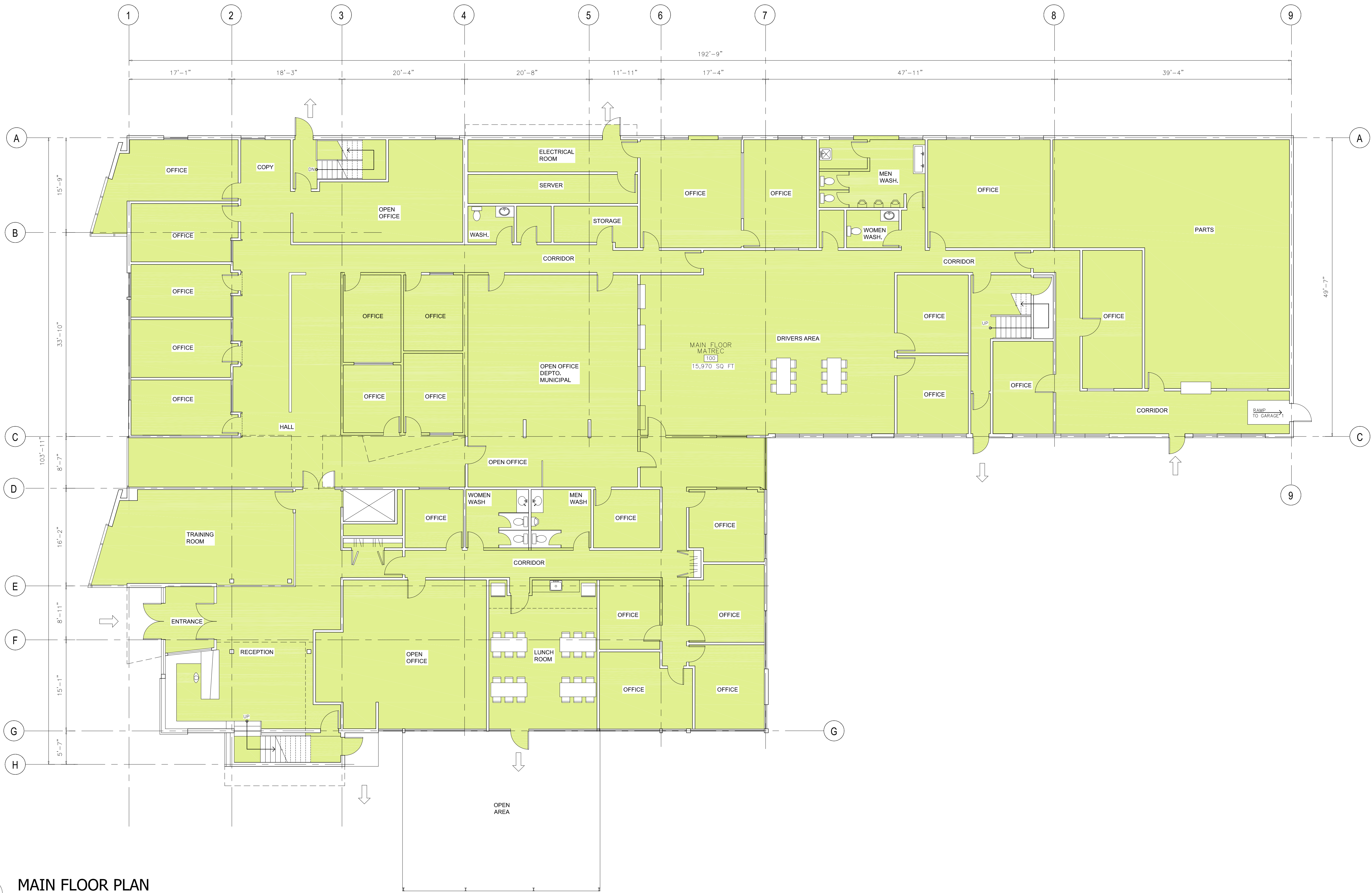
1 MAIN FLOOR PLAN Scale: 1/8"=1'-0"