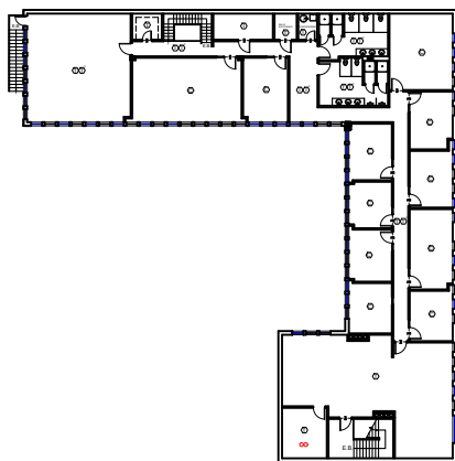
2E Etage / Second Floor